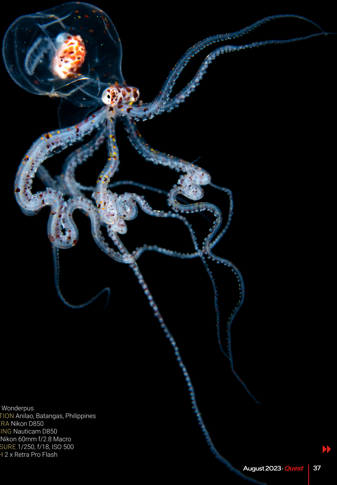
TITLE Wonderpus LOCATION Anilao, Batangas, Philippines CAMERA Nikon D850 HOUSING Nauticam D850 LENS Nikon 60mm f/2.8 Macro EXPOSURE 1/250, f/18, ISO 500 FLASH 2 x Retra Pro Flash