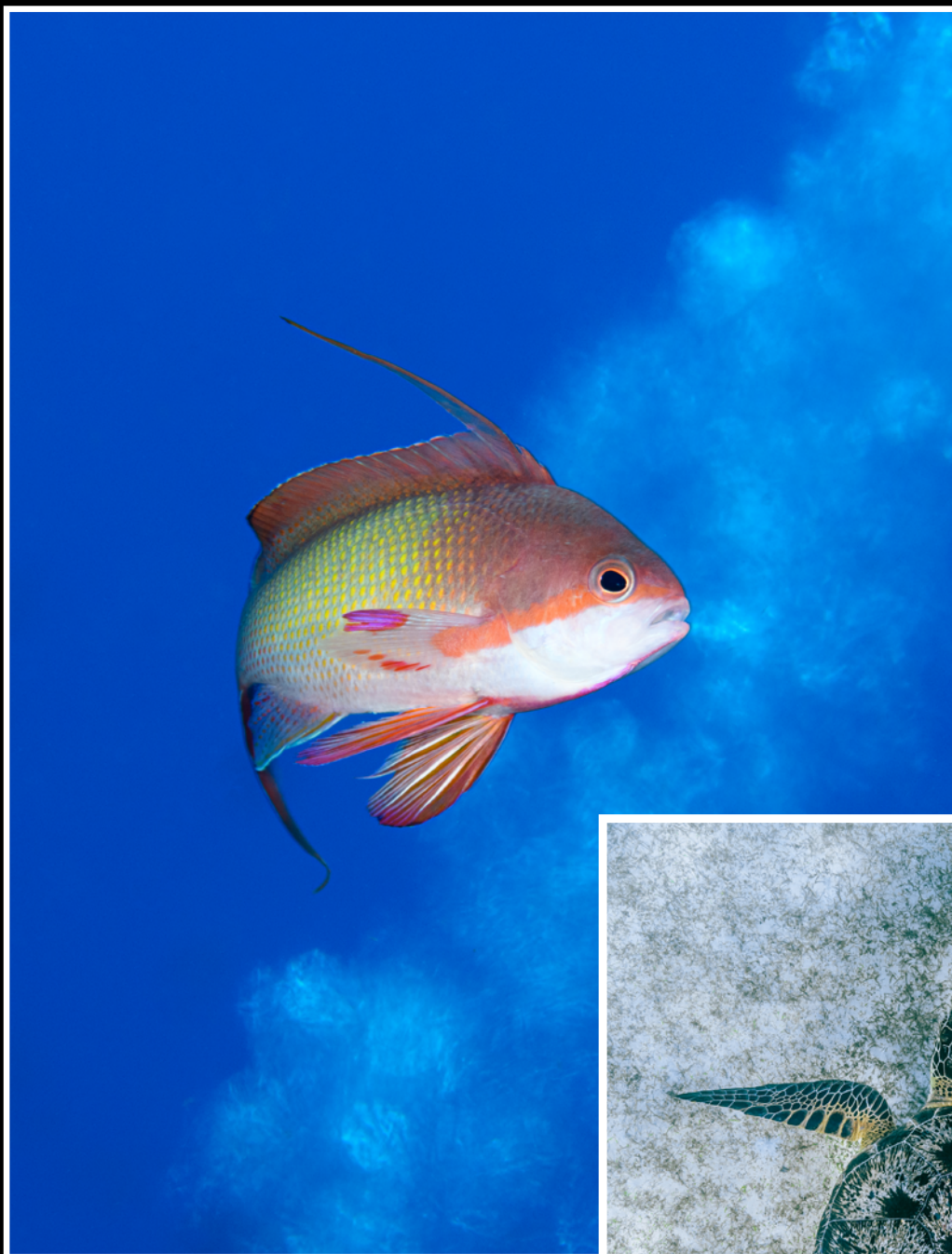
TITLE Male Anthias LOCATION NEOM, Saudi Arabia CAMERA Nikon D850 HOUSING Nauticam D850 LENS Nikon 105mm f/2.8 Macro EXPOSURE 1/200, f/16, ISO400 FLASH 2 x Retra Pro Flash