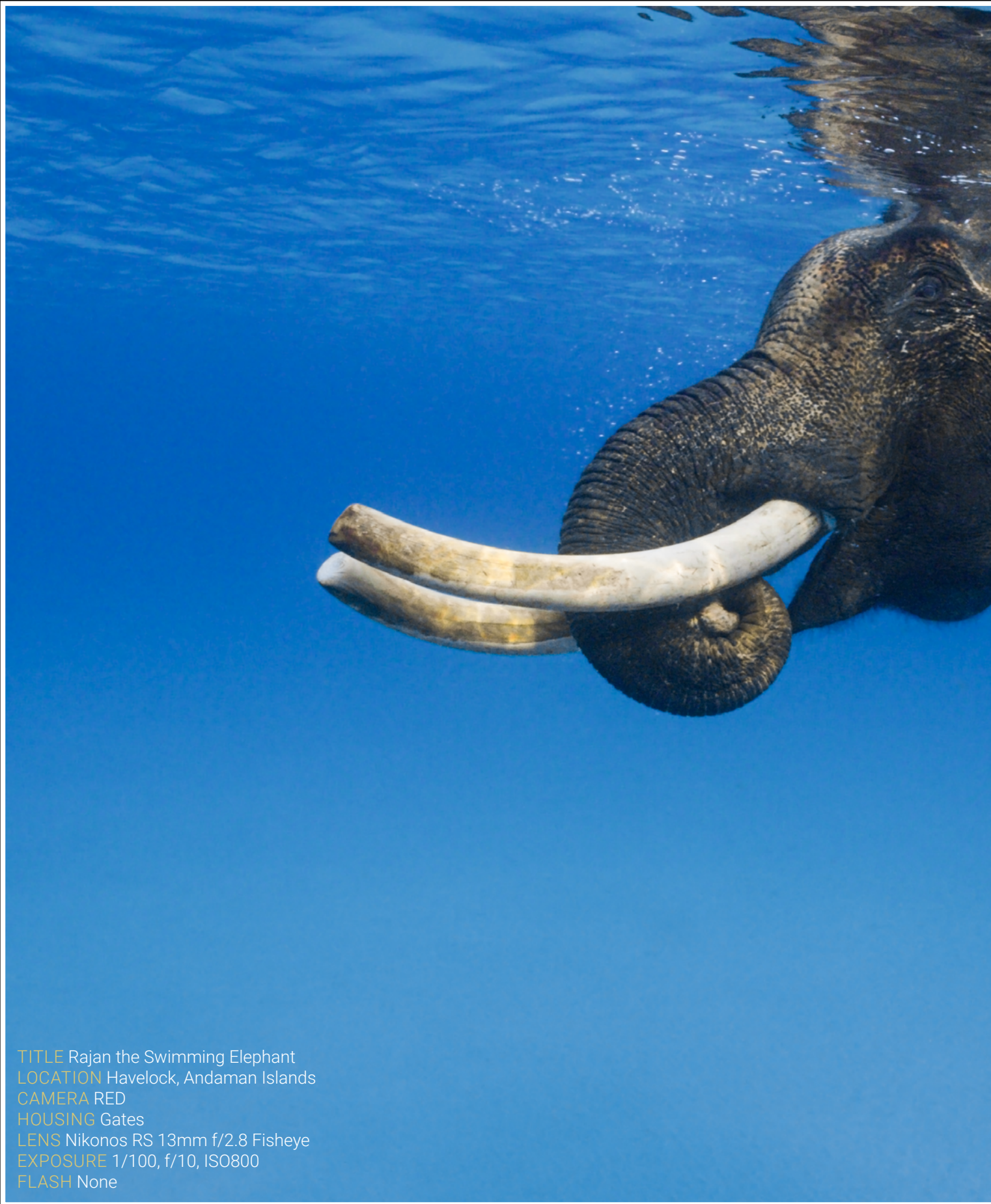
TITLE Rajan the Swimming Elephant LOCATION Havelock, Andaman Islands CAMERA RED HOUSING Gates LENS Nikonos RS 13mm f/2.8 Fisheye EXPOSURE 1/100, f/10, ISO800 FLASH None