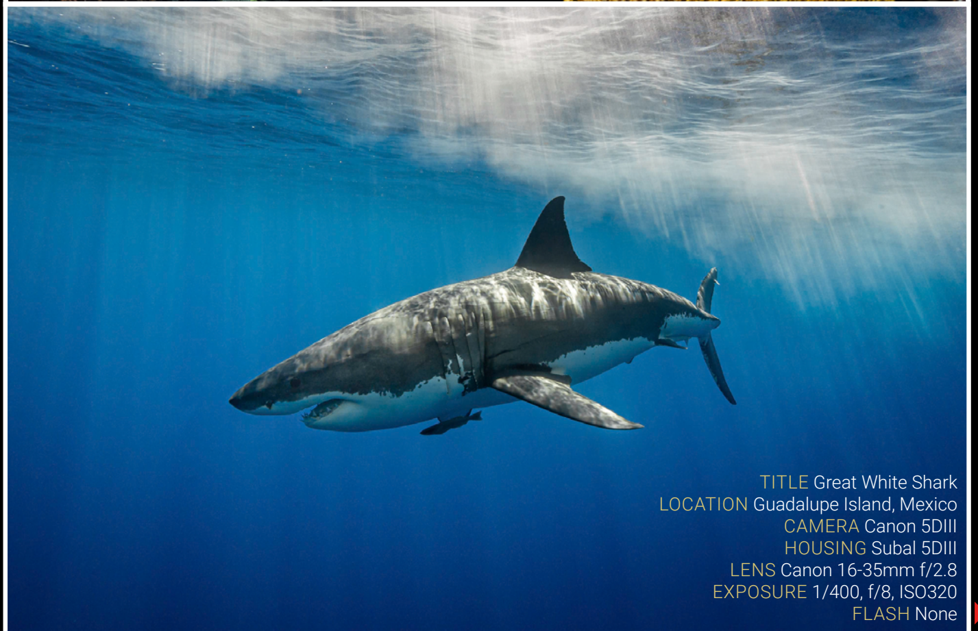
TITLE Great White Shark LOCATION Guadalupe Island, Mexico CAMERA Canon 5DIII HOUSING Subal 5DIII LENS Canon 16-35mm f/2.8 EXPOSURE 1/400, f/8, ISO320 FLASH None