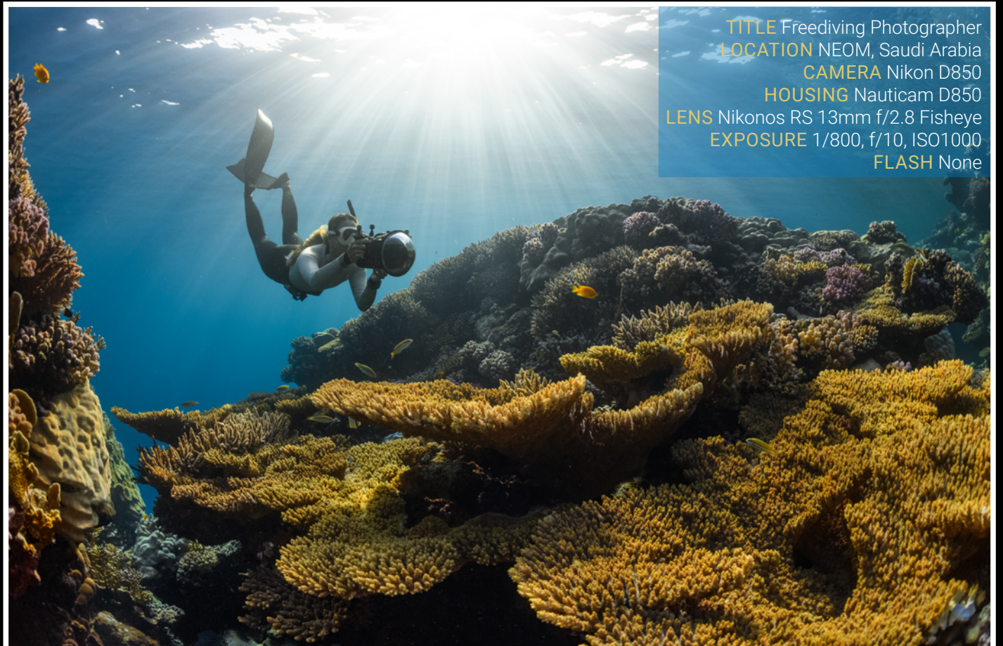
TITLE Freediving Photographer LOCATION NEOM, Saudi Arabia CAMERA Nikon D850 HOUSING Nauticam D850 LENS Nikonos RS 13mm f/2.8 Fisheye EXPOSURE 1/800, f/10, ISO1000 FLASH None