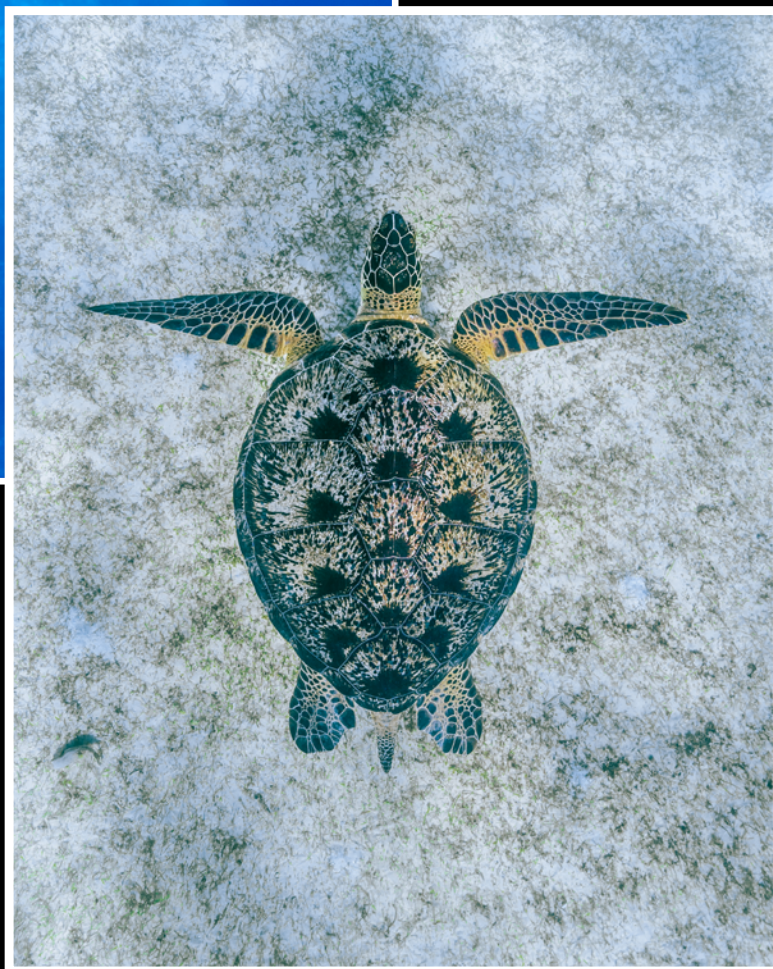
TITLE Green Turtle LOCATION Nosy Be, Madagascar CAMERA Sony A7IV HOUSING Marelux A7IV LENS Sony 12-24mm f/2.8 EXPOSURE 1/200, f/11, ISO400 FLASH None